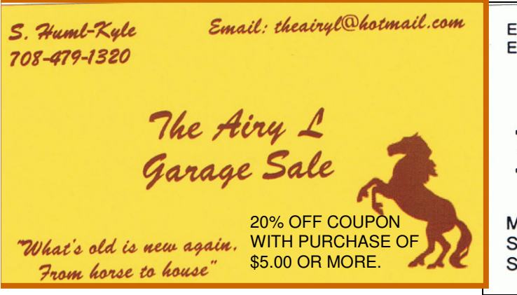
See The Airy L at New Location: Derald's Flea Market. 219 Maple St. Joliet, IL 9a-4p Sat & Sun Booth #32